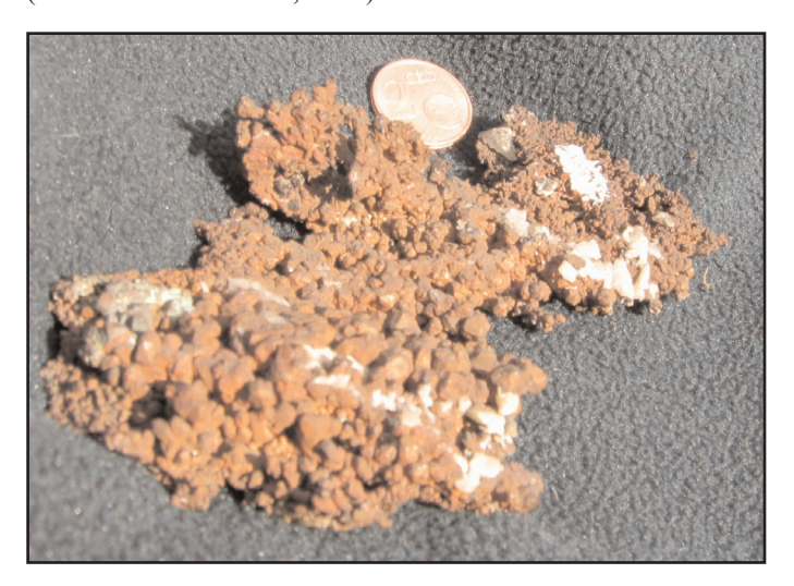
Figure 1. Native copper from the Tankardstown area. National Museum of Ireland, Natural History specimen G1359. Two cent coin for scale.

Crystals of cuprite on native copper were recorded from Kilduane mine by Smyth et al (1864) and some of Smyth's specimens with native copper, collected in 1847, are preserved in the Russell Collection in the Natural History Museum (London). It has not, to the author's knowledge, been found at Kilduane in recent times. The Russell Collection also includes cuprite from "Knockmahon mine". Veinlets of massive cuprite, with traces of copper and minor botallackite have been reported in a vein outcrop in a small cove at grid ref. X 444 986 (Braithwaite & Wilson, 2001).