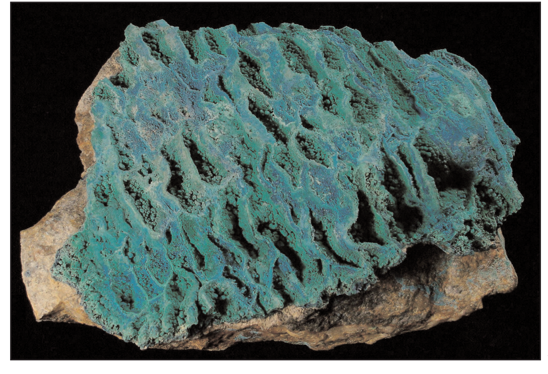
Figure 2. Rippled malachite with blue langite, from the walls of Tankardstown mine. Field of view 11 x 7 cm.

The cobalt arsenide from Tankardstown is of interest as the presence of erythrite has been known for a long time, without any record of a primary cobalt ore as its source. It is hoped future work will confirm its identity more precisely.