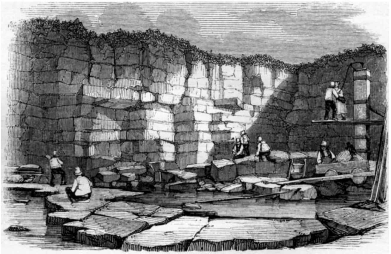
Black marble quarry near Galway