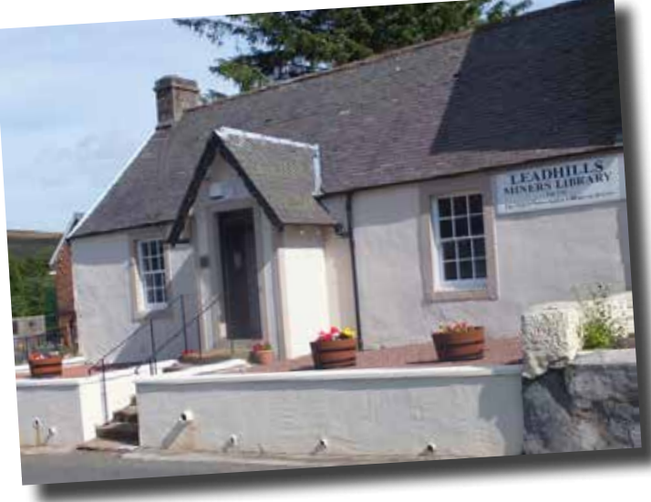
Miners' Library, Leadhills