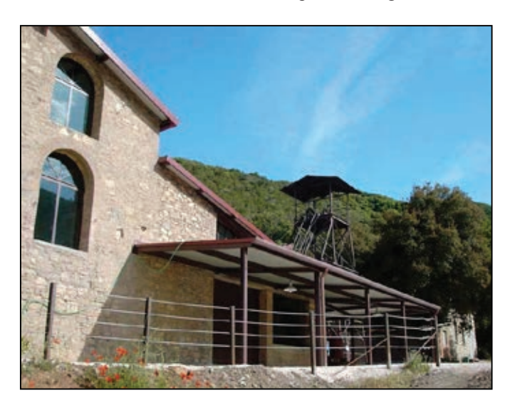
San Silvestro Archaeological Mines Park

Fallonica was the principal centre of iron-making in Tuscany until the late nineteenth century. Founded in 1995, the Museum lies within the perimeter of the old Grand Ducal Ironworks (latterly run by ILVA) a complex dating back to the 16th century, with important extension work being done at the start of the 19th century that produced some particularly prestigious industrial architecture. The site incorporates the guard houses,