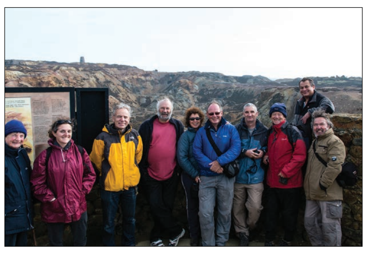
MHTI members at the viewing platform above the Parys Mountain opencast created in the late 18th-early-19th century, by the collapse of near surface workings, some of which might have been of great antiquity

A number of collapsed bell pits, some up to 20 metres underground, containing a mixture of hammer stones and oak charcoal were discovered. The form of these deposits seem to suggest the deposition of worked mine spoil within a series of steeply inclined opencasts dug on surface weathered portions of quartz stockwork veins. Archaeologist, Simon Timberlake, suggests that the access for these seems to be on the underlie of chalcopyrite veins at points where these could be excavated through the softer and partly decomposed pyritic shales and slates coinciding with areas where the local water table had been lowered due to fracturing and previous solution of the sulphide veins. The rapid oxidation of pyrite following its exposure will have led to the formation of a gossan, most of which will have been removed through glaciation, though in places this would have become partly re-established during the time leading up to the Bronze Age. Native copper and tenorite were noted in gossans beneath the soil above some of the virgin copper veins in the 18th/19th centuries and it therefore seems likely that the Bronze Age miners could have been extracting these minerals from the surface and perhaps also the copper sulphate minerals found today within the zone of rapidly oxidising sulphide underground.