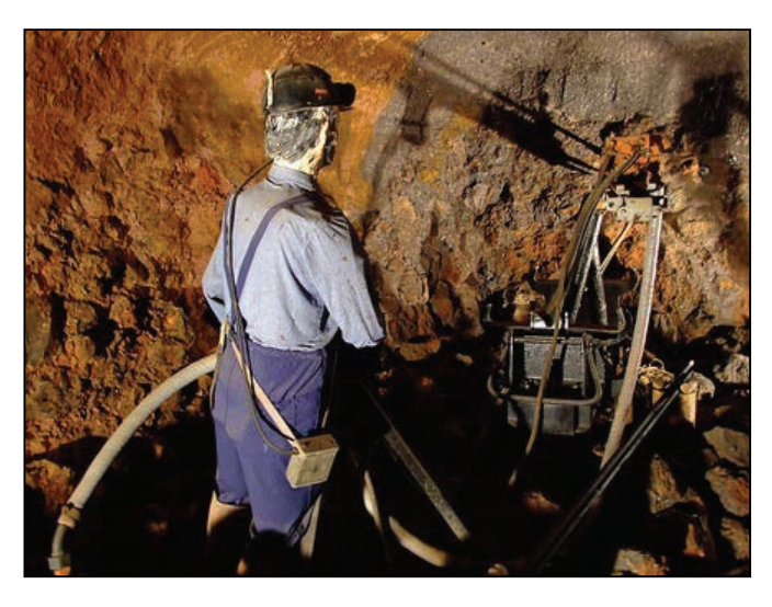
Exhibit inside the recreated Picolla Miniera on Elba, accessed by tourist train