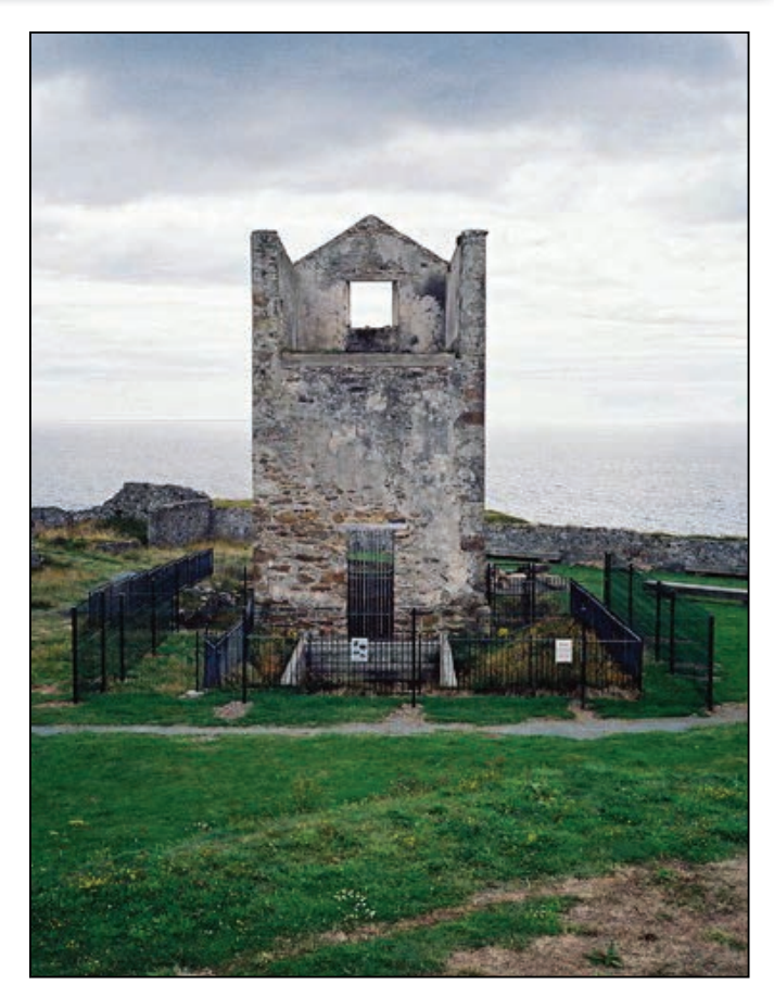
New fence around Heron's Shaft, Tankardstown

On the 23rd August the Department of Communications, Energy and Natural Resources published a "Request for Tenders for Technical, Design, Procurement and Project Management for Remediation works at the Avoca Mine Site via a Single Supplier Framework Agreement". The aim of the remediation works is to reduce the on site risks to health and safety. The proposed works are outlined in the document, and