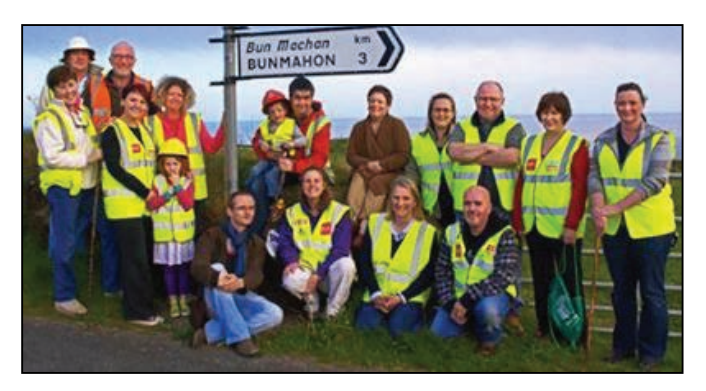
The A to B team!

When the mines closed in Allihies during the famine, numerous families walked to Bunmahon in search of work and many people died along the way. Dubbed the A to B, this tough 200 km 8-day walk now in its third year, is an historic re-enactment of their tragic journeys, paying respect to their struggle. According to one participant, 'you don't have to be mad to walk from A to B, but it helps!'