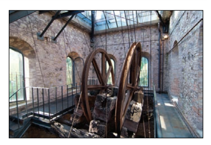
The impressive restored head frame in the Alfredo Shaft hoisting tower

This superb mining heritage attraction is just outside the picturesque medieval hilltop town of Montecatini. The mines, operative until 1907, were exploited by the Etruscans, the Medici and the Grand Duchy of Tuscany; they had their heyday in 1888 when the Società Montecatini was established (this then became Montedison), named after the town. In 2002 the Caporciano Mine opened as a mining heritage attraction. Features include the extant remains of the mines' dressing floors; the imaginatively preserved steam winding gear in the ornate Alfredo Shaft hoisting tower complete with glass apex; the Muraglione Dam, built to provide water for the steam engines and dressing operations; numerous mine buildings at the surface housing interpretative material detailing the mine's history and chance to venture underground into the eighteenth century mine workings on a guided tour. A documentation centre accommodated in the fourteenth century Palazzo Pretorio of Montecatini contains more interpretative material about the Colline Metallifere and an impressive archive collection relating specifically to the Caporciano Mine.