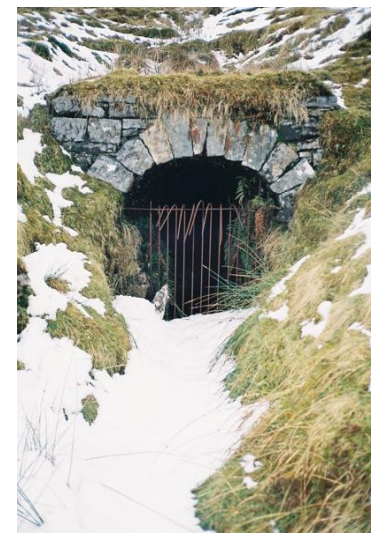
Old adit, Gubnaveagh, Bencroy Mine