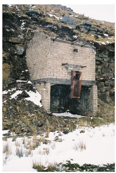
Hopper, Gubnaveagh, Bencroy Mine