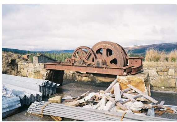
Winch gear, Gubbarudda