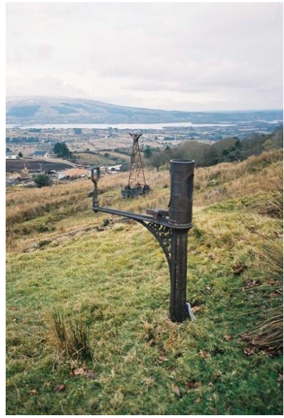
Weighbridge & aerial ropeway, Kilronan Mountain