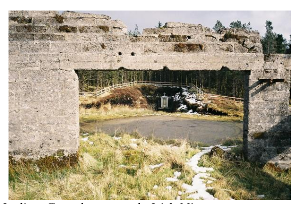
Incline, Greaghnageeragh, Irish Mines

Publications marked * are available to download at <a href="http://books.google.com">http://books.google.com</a>