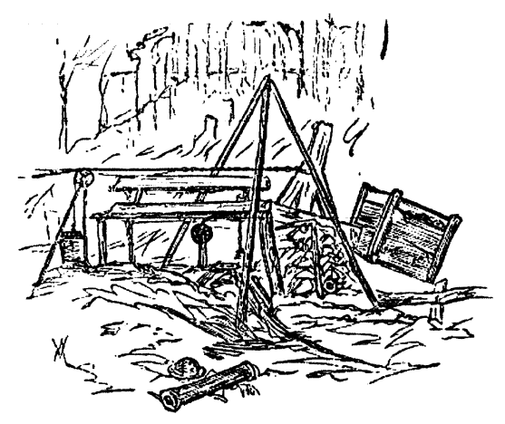
MINE PUMP ON AVONDALE ESTATE.