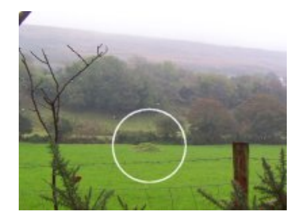
A filled silver mine shaft, now marked by a mound after subsidence. It is thought the adit draining to the sea comes from this area. It is thought locally that this shaft is over 100 feet deep.