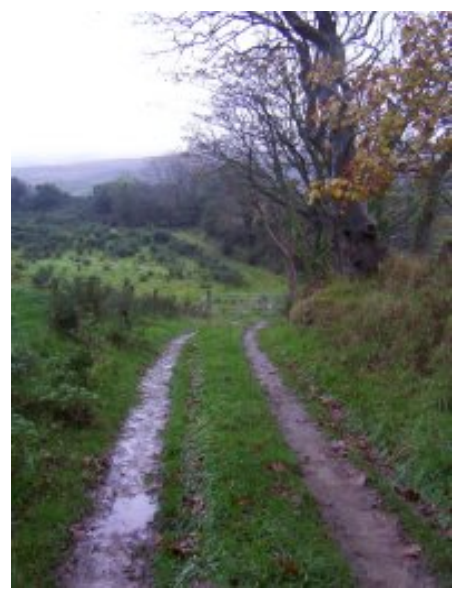
The track going between the two silver mine shafts. The lead mine is further over on the left – nothing remains.