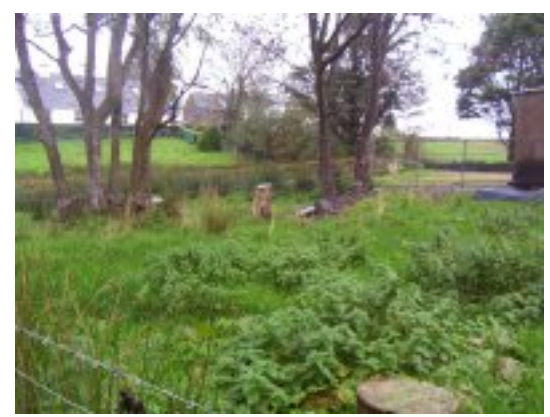
The site of a silver mine shaft. Close to it there is one of the original mine buildings, which had a fireplace.

from the sea. I hope to fully write about this mine at a later stage.