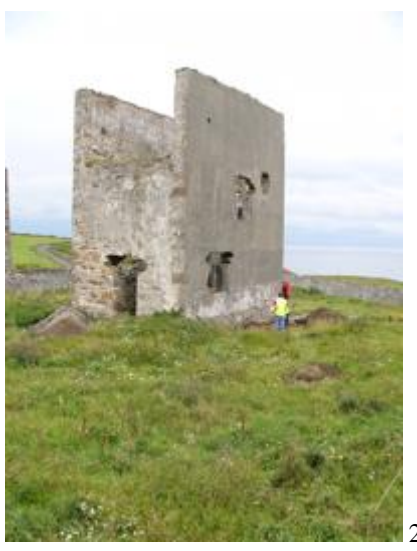
Figs 1 and 2. Tankardstown Pumping Engine House, viewed from the SE and NW respectively. Note start of excavation trench along SW wing wall in Fig. 2; and spoil heaps from interior and exterior excavations in both photos. Spoil in Fig. 2 sits almost exactly on top of the shaft site, all held in place by no more than the lorry shoved down the shaft in the film "The MacKenzie Break"!

Figs 3 and 4. top right and middle right. Views of internal excavation looking NW and SE respectively: Flor Hurley, supervising archaeologist, in hard hat in Fig. 3; and your Chairperson hard at work playing with yet another electronic gizmo in Fig. 4. The seriously damaged area of the cylinder loading plinth is clearly visible in Fig.4: most of it has been excavated away in past times, leaving undermined sections of rear and wing walls and only a portion of the cataract pit wall (right of hardhat).