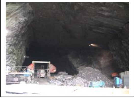
Another general view of slate extraction and processing facilities within the principal slate cavern, which was excavated during the 19th C.