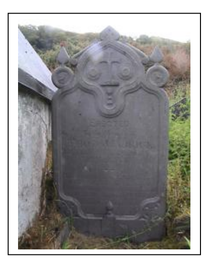
Two mid 19th C Valentia slate gravestones: above - Carrick gravestone, inscription date 1860 [Kylemore Burial Ground]; below - Smith gravestone, inscription dates 1847 and 1854 [Church of Ireland Graveyard]