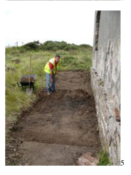
Fig. 5. Opening up exterior excavation trench along the SW facing wing wall.