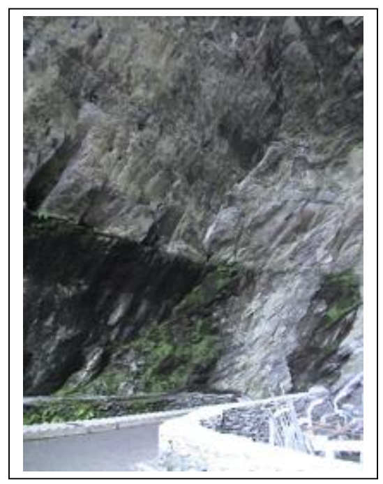
View of the 19th C extraction bench timbers, high up along the side wall, and the inner grotto platform, now acting as a viewing area for the slate products.