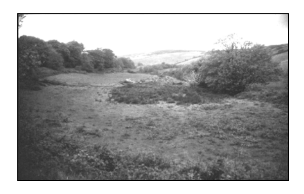
Maulagow . General view of boglands from which copper rich peat was extracted.

The day started overcast and dis-improved very rapidly, as, over the next few hours we were doomed to experience every conceivable form of rain. First stop Glandore – to view the remnants of the manganese mine and the Maulagow boglands.