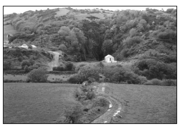
Modrana Quarry. Above: general view.

Next day, a complete contrast, visiting 3 slate quarries, again led by our friends from the Rosscarberry and District Historical Society. First stop, Modrana Slate Quarry [W23282 39251]. Workable slate deposits were first discovered at Benduff (see below) about 1812, though these here, and nearby at Cooladreen (see below) are somewhat later in Here the workings are primarily origin. underground, in the form of a series of about 10 interconnecting galleries, each measuring up to about 15m in plan view and 10m high. The pillars between connecting galleries are punctured by sublevels, with a ventilation drive at the top of each pillar to provide an exhaust route for blasting fumes. The slate was worked in "veins"; these defined as joint blocks which determined defined maximum size of blocks of slate extracted for splitting and dressing. The galleries here are a sight to behold, and reasonably easily accessible with wellies to traverse the flooded first and second galleries.