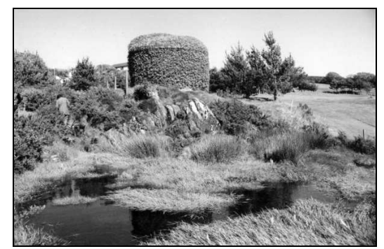
Coosheen Mine . Powder house, with Ewan Duffy standing in adit cutting on the left.

About 300m below this, and close to the edge of Schull Bay, there is a complex of single storey buildings which are almost certainly part of the mine infrastructure though hard now to decipher. In the building at the south end of the complex, we found in situ narrow gauge [74 cm outside rail edge, 70 cm inside rail edge] rail lines (as well as bogies) below a possible entry point opening in the upslope side of the building. We also visited the inland end of Coosheen site: mainly fenced off shafts, the heavily overgrown remnant of an engine house wall [V 94529 31302], now incorporated into a farm-yard enclosure, and concrete foundations of a 20<sup>th</sup> C winding engine house.