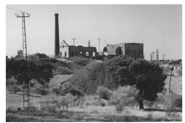
The chimney within an active mine site

Five sites – and no engine house. So was the vignette illustration no more than a flight of allegorical fantasy? The short answer appears to be no. As luck would have it, the very first of the 6 sites I visited, and which I spent about 4 hours surveying, is the prime suspect. But I'm not going to disclose details of that here – all will be revealed in the Journal. John Morris.