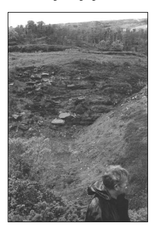
Benduff Quarry . Memorial at foot of rock crag/land fill. Note low scarp in background marking hanging collapse fracture of 1892.

The quarry was opened in 1830 and it provided considerable employment, estimated at about 150 men per year, up to 1892. Then disaster struck. Quarrying activities had undermined a large hanging wall mass, and