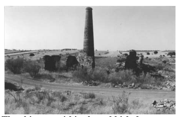
The chimney within the rubbish dump

Eureka! I thought – but it wasn't to be. The building complex illustrated in Newsletter 19 most definitely does not include any remnants of a Cornish Engine House - not even the building which I thought might be an engine house (see pictures above). But at least the top of the spoil heap provided a good vantage point to spot other sites, especially chimneys. I checked out 4 of these, again all to no avail. Chimneys are conspicuous at two of these just to the SW of the town, one now within the limits of the town rubbish dump (picture - GR VH 2520 4905), and the other within a nearby active mine complex (picture – GR VH 2495 4885). But no obvious engine houses, though I admit I did not try to enter the active mine to try and get a closer look at the rather fine looking set of buildings adjacent to the chimney.