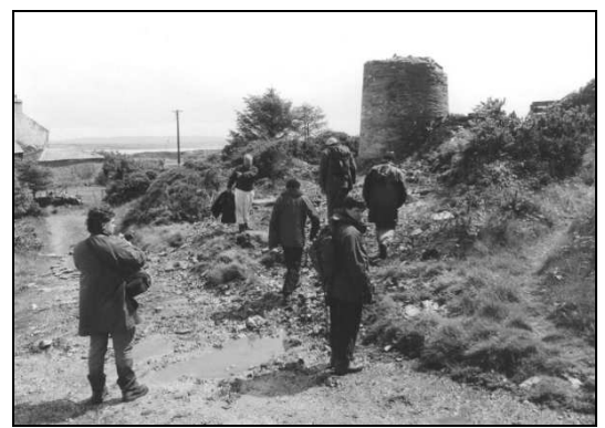
Cappagh chimney . The sad remains of what was until early this year a local landmark.

in good shape, as are the remains of a terrace of probable workshops. Tom Reilly showed us a curious hollowed out depression in the bedrock beside these, which looks quite unnatural – perhaps a pestle connected to assay work in one of the adjoining buildings?