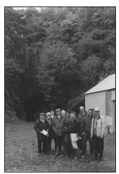
Modrana Quarry . Close up of entrance to underground workings with MHTI group.

The Cooladreen Slate Quarry [W 23576 39467] is about 600m across the valley from Modrana. When extraction commenced here is uncertain, though as it is mentioned by Griffith, Cole and Kinahan, it was probably in existence by at least the 1880s. In contrast to Modrana, operations here were entirely by open pit, which extended to a depth of about 40m when operations ceased in 1939. The workings were serviced by a very large gantry crane on one side of the pit, of which only the masonry foundation now remains - though a picture of it is reproduced in Volume 3 of the Rosscarberry and District Historical Society Journal. Amongst other winding functions, this operated a 2m square cage for winding the quarrymen up and down from the bottom of the pit. The relatively small slates produced from this quarry were sold locally, unlike those from Modrana which were sold throughout Ireland and exported to the UK through Skibbereen and Glandore. estimated that the waste: product ratio in both quarries was about 90:10.