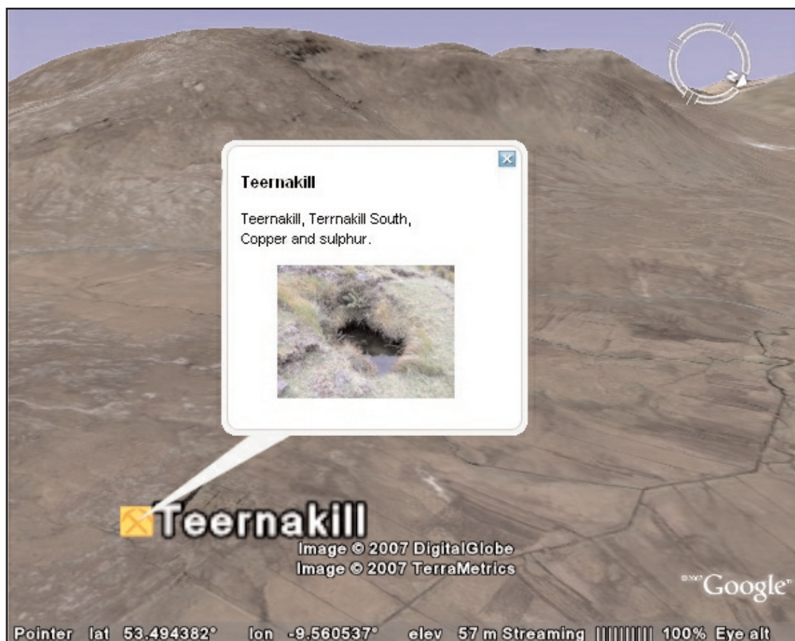
Figure 4: Screenshot of the Teernakill Copper and Sulphur Mine in Google Earth. This oblique perspective looks west-southwest towards the Corcogemore/Mauntnurk Mountains from Lough Corrib. (The route of the Teernakill Mine Tramway is visible in the satellite imagery, running eastwards from the mine to the shore of Lough Corrib).

a site to provide a repository for information on mining heritage in Ireland is great. The value of such a site would be in the ability for any interested person to contribute information, a task that is restricted in traditional websites, such as the MHTI site. As demonstrated here, the ability to publish geospatial mining information freely on the Web, using interactive map applications, presents an exciting and resourceful approach to the dissemination of mining heritage information.