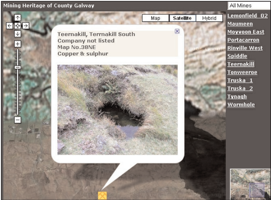
Figure 2: Screenshot of the Mining Heritage of County Galway Google Map page (satellite view). This image shows a pop-up information window for Teernakill Copper and Sulphur Mine, with associated mine inventory information and photography.