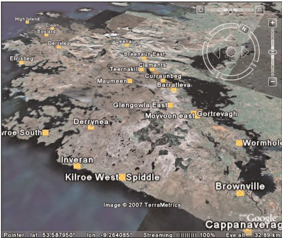
Figure 3: Screenshot of the Mining Heritage of County Galway Google Earth KML file viewed in Google Earth. This oblique perspective, looking northwest from Galway Bay towards Killary Harbour, shows the distribution of some of the mines through Connemara (see Figure 1 for Google Map plan view). Some locations are automatically obscured relative to this perspective to reduce the effect of overlapping labels.

and contributors of a variety of digital content. The proliferation of wikis, blogs, photo-sharing sites, social-networking sites, and content management systems (CMS) attest to the success of user generated content on the Web. Through the use of